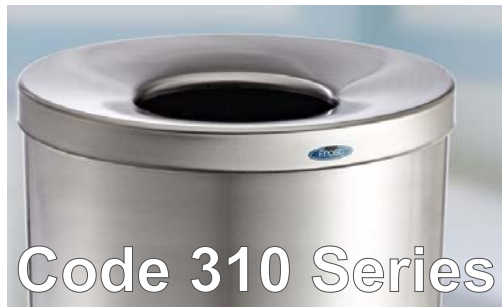
Code 310 Series

Overall dimensions in inches (centimeters in brackets)